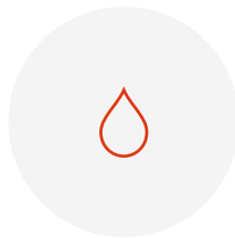
Stablex™ Cohesive Gel