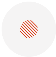
Cristalline Soft-AD™ Surface

Anatomical implants are popular because of the natural enhancement they offer as well as correcting shape problems and lax tissues 1 .